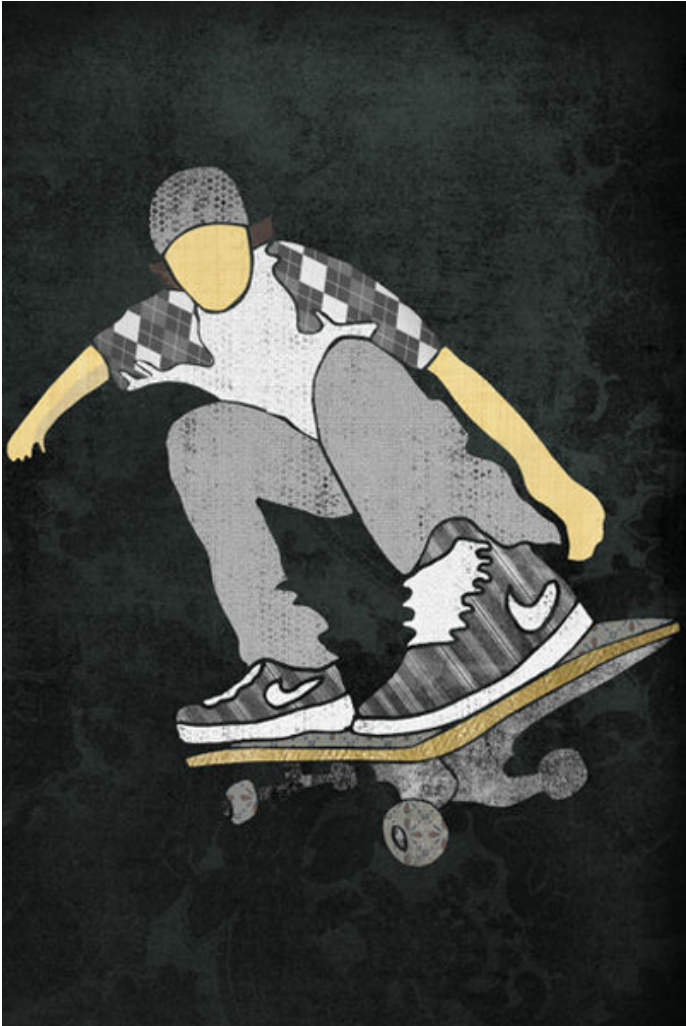
Carry Strap Lock